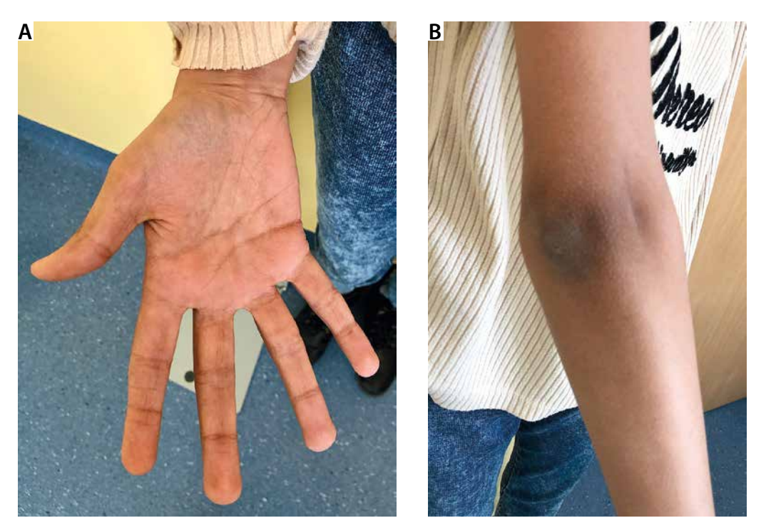
FIGURE 2. Hyperpigmentation of the furrows in the hands (A) and the skin on the elbow (B) of the patient

indicated autoimmune thyroiditis were found. Figure 3 shows the ultrasound picture of the thyroid gland.