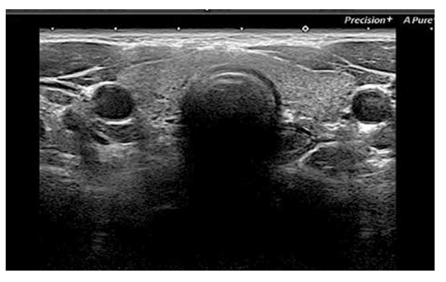
FIGURE 3. The actual ultrasound picture of the thyroid gland in the patient. The thyroid gland is not enlarged, but it is hypoechogenic Thyroid ultrasound was performed with a Toshiba Premium Aplio 400.

There are autoantibodies like, for example, TPOAb for AITD, an anti-21-hydroxylase antibodies for AD, and GADAb for T1DM, that may be detected before the manifestation of APS-2 [4, 9]. However, it should be remembered that the presence of such autoantibodies is not equivalent to glandular failure [4]. In our patient, GADAb was detected before full-blown DM1 developed.